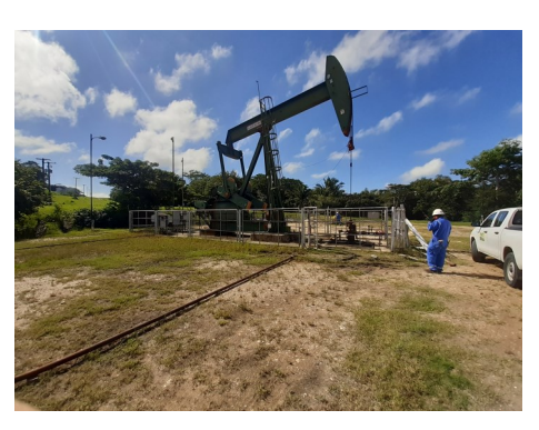
BNE Sucker Rod Pump

FCRL Belize Ltd. which holds a current Production