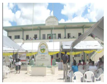
Our Lady of Fatima R.C. School Building